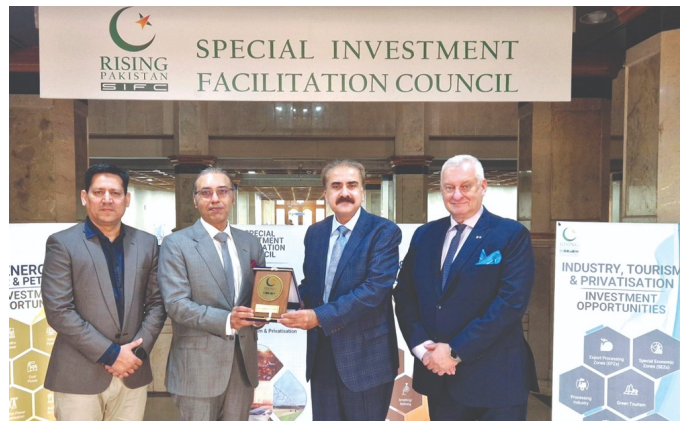
Meeting with Secretary Special Investment Facilitation Council (SIFC)