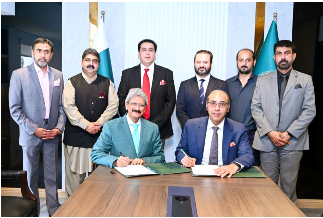
RCCI Signs MoU with TXYCO for Member Discounts on Ride Services