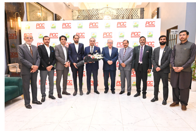
Prize Distribution Ceremony at Punjab Cash & Carry