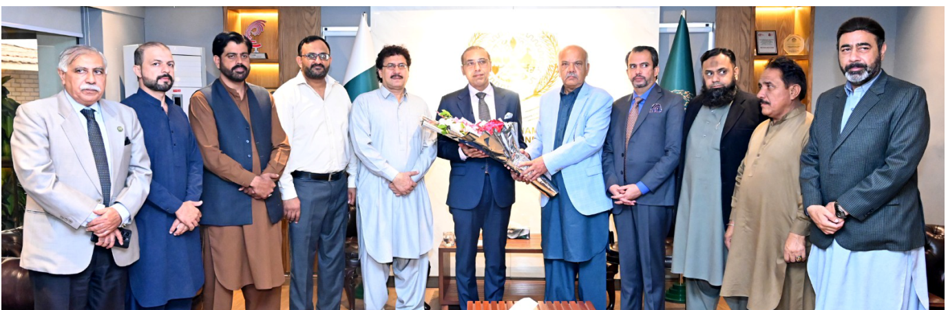
Visit by Peoples Traders Cell Rawalpindi Delegation to RCCI