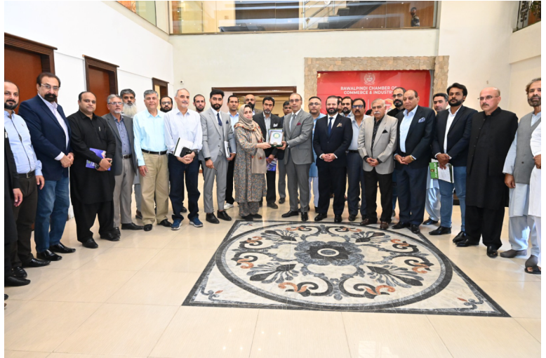
Awareness Session on Business Facilitation Center (BFC) A Step Towards Simplifying Business Processes!