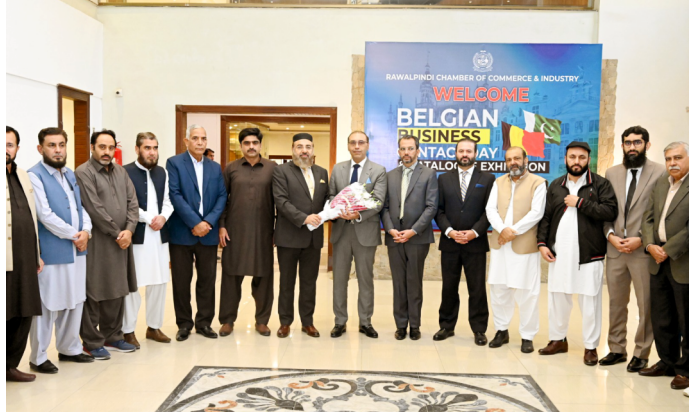
Visit of Pakistan Paint Manufacturer Association Delegation