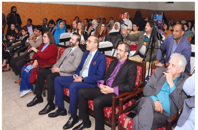
RCCI President Graces Rawalpindi Press Club Event