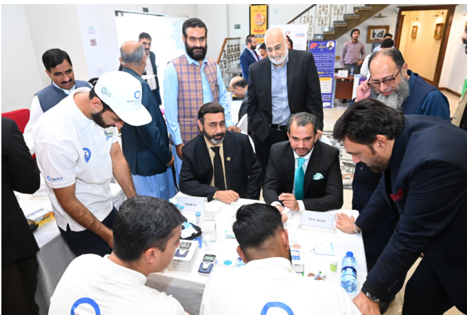
RCCI Observed World Diabetes Day.