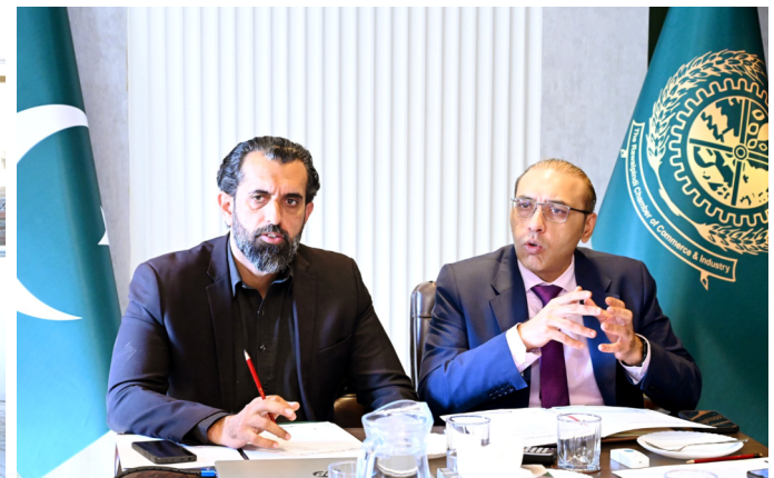
Management Board Meeting