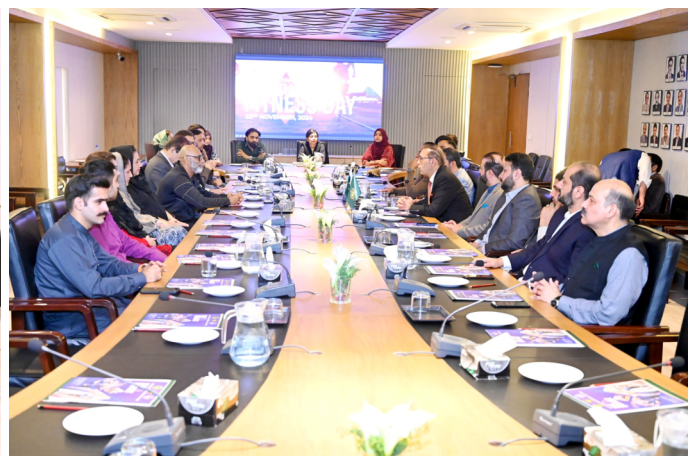
RCCI hosted Health and Fitness Day at Chamber House!