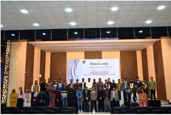
RCCI VP attends Global Entrepreneurship Week 2024