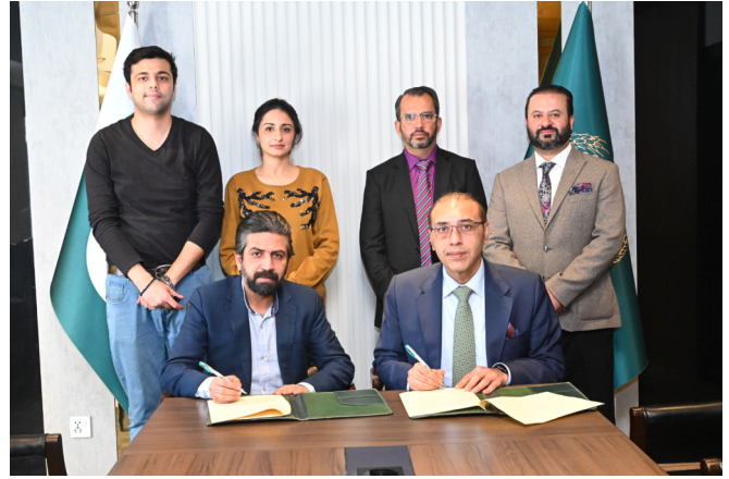
Memorandum of Understanding (MOU) Signing Ceremony Smile Center Dental Clinic