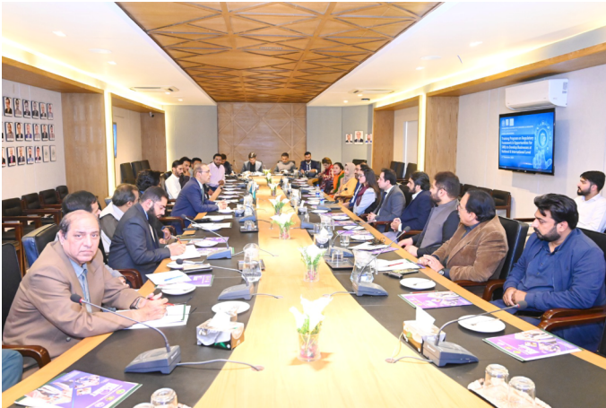
Session on Regulatory Framework of Pakistan and Business Promotion