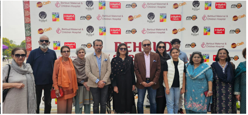
Ribbon Cutting Ceremony at Behbud Art and Craft Bazaar