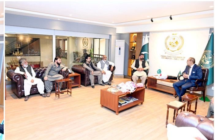
Talwaran Bazar Delegation Meeting