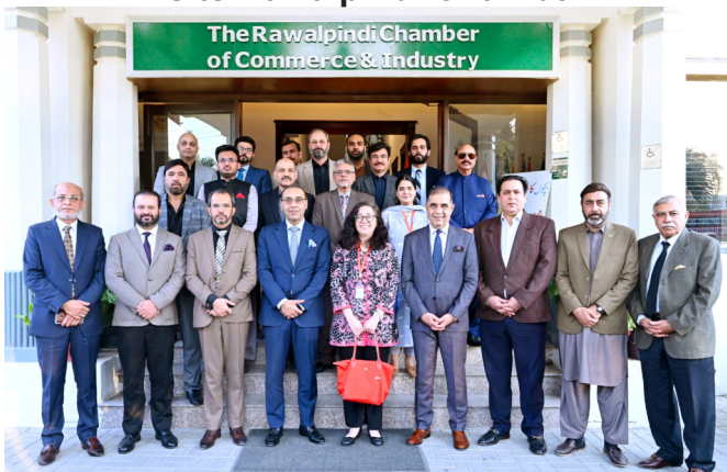
Group Photo Meeting with Head of Economic Affairs, Embassy of Indonesia in Islamabad