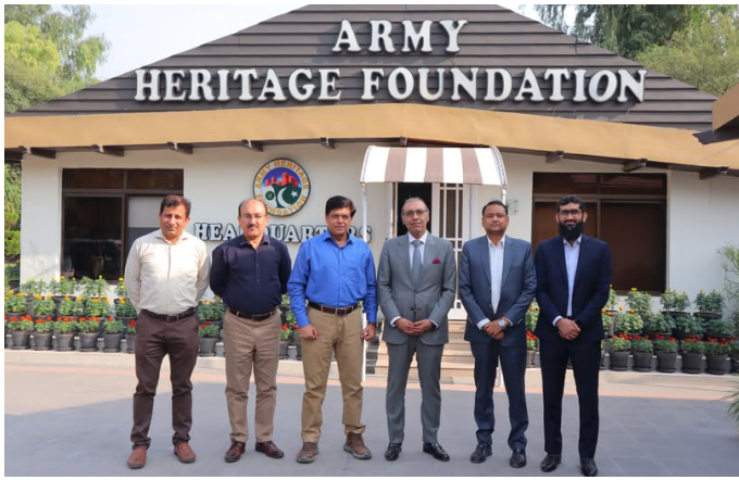
Meeting with DG Army Heritage Foundation (AHF)