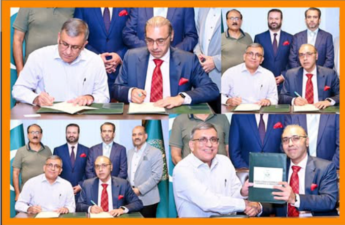
RCCI Inks MOU with Adil Diagnostics .