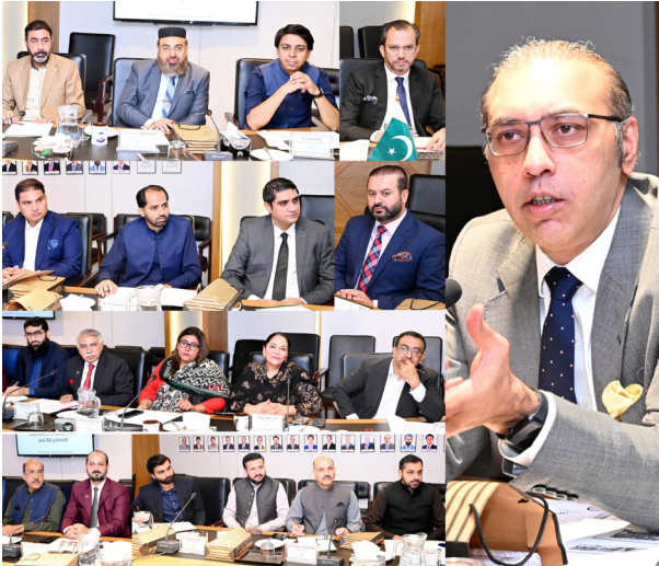
2nd RCCI Executive Committee Meeting 2024-26