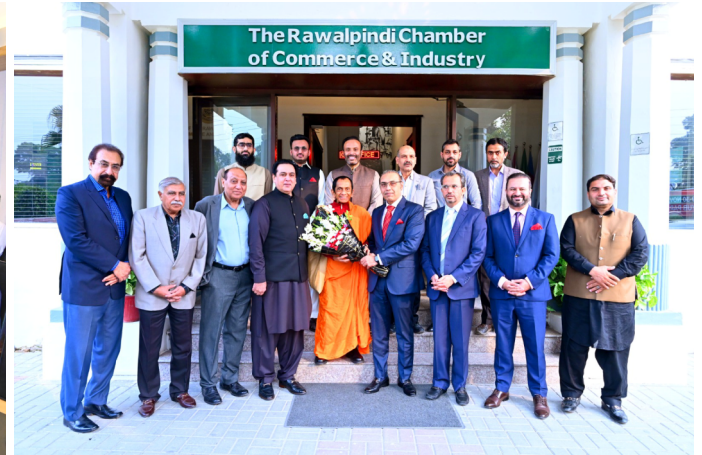
Session on Religious Tourism and the Economy of Pakistan