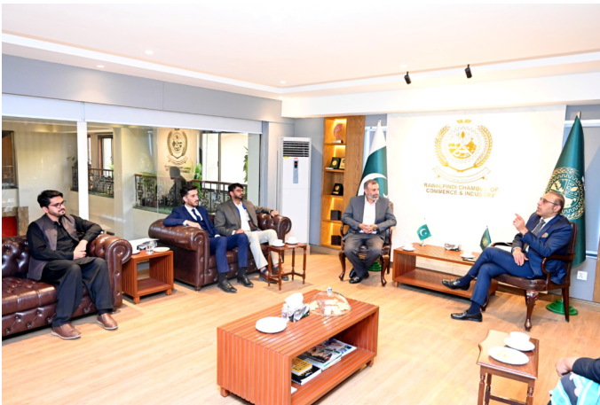
Strengthening Industry Academia Linkages Meeting with Dean Riphah University