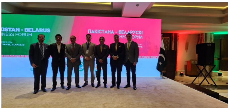
Meeting with Belarus Business Delegation