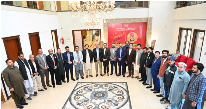
Visit of RECA Association Delegation