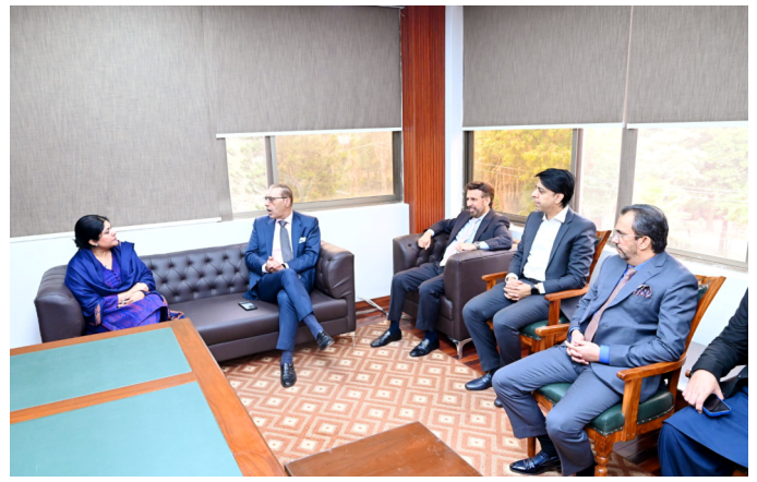
Meeting with DG RDA on Ring Road Economic Zones