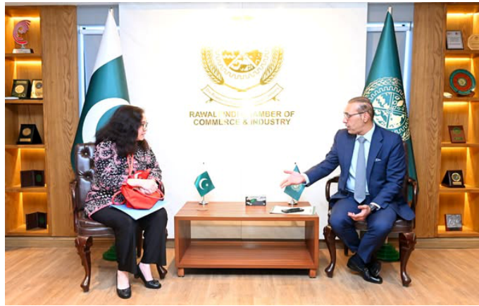
Meeting with Head of Economic Affairs, Embassy of Indonesia in Islamabad