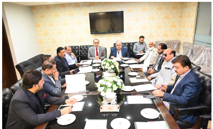
Meeting of RCCI Medical Welfare Council (RMWC)