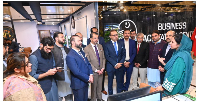
Visit to Business Facilitation Center (BFC) Rawalpindi