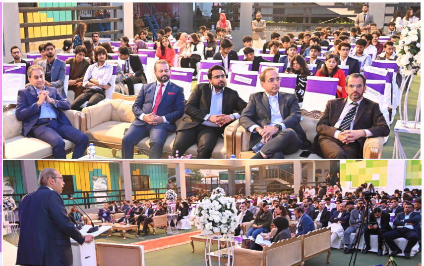
Business Summit 2024 Globalization Emerging Markets