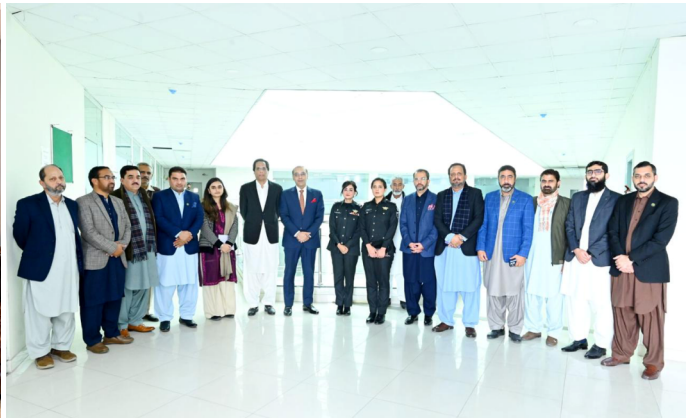
Group Photo Meeting with Collector Customs