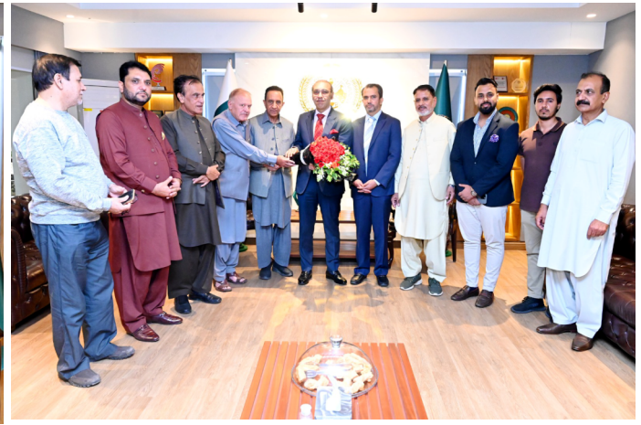
Delegation of Promoters Welfare Group